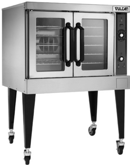
Model VC4ED Shown with optional casters