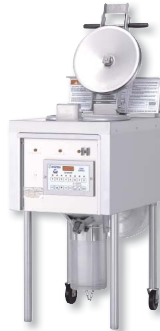
PF46C COLLECTRAMATIC® FRYER

Built to comply with applicable standards for manufacturers. Included are UL, C-UL, UL Sanitation, DEMKO, CE, and MEA.